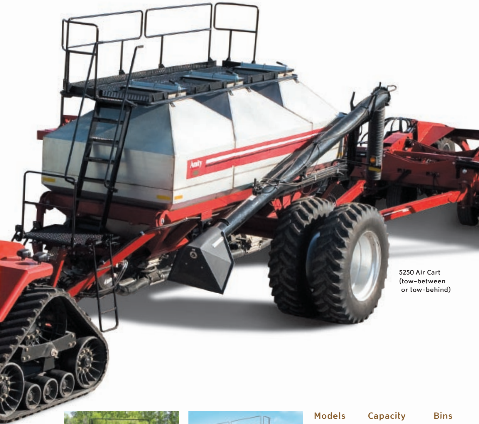
5250 Air Cart (tow-between or tow-behind)