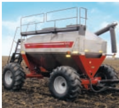
2800/3350 Air Cart