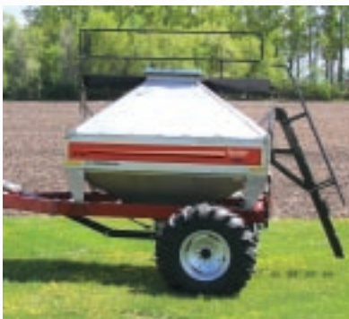
ST250 Air Cart