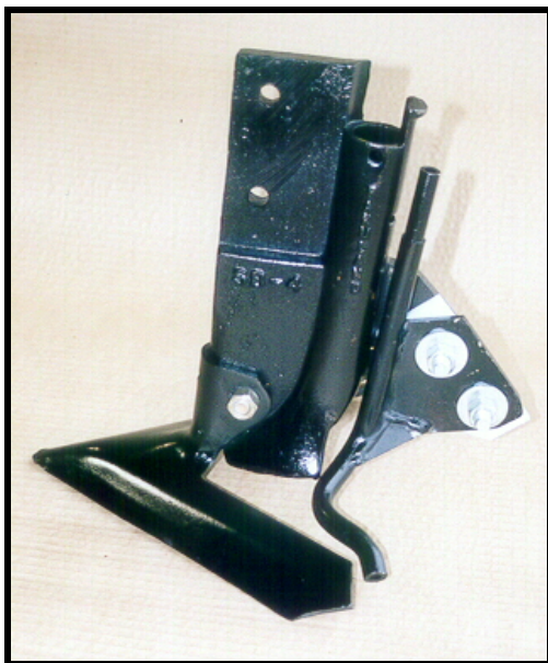
EXAMPLE: Case 11" LD With Farmland SB4 seed boot

Apply anhydrous ammonia at the time of seeding using a tube that is form fit to the back of the sweep and extends out to the tip of the sweep wing. Wing tip injection of NH 3 is safe from seed damage and requires little extra horsepower.