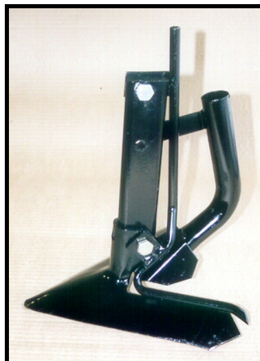
Example: Concord boot and transition